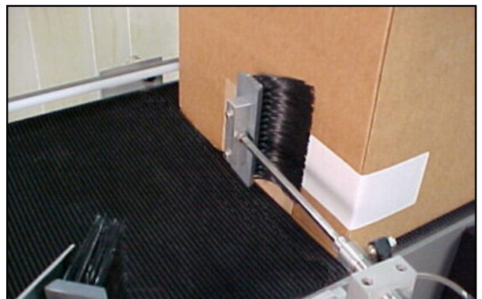
Duro 4.5 Corner Pneumatic Wiper Brush

The conveyor belt that typically comes with this machine can reach speeds up to 600 inches per minute. We have other options available that take into consideration the speed and length required for your specific application.