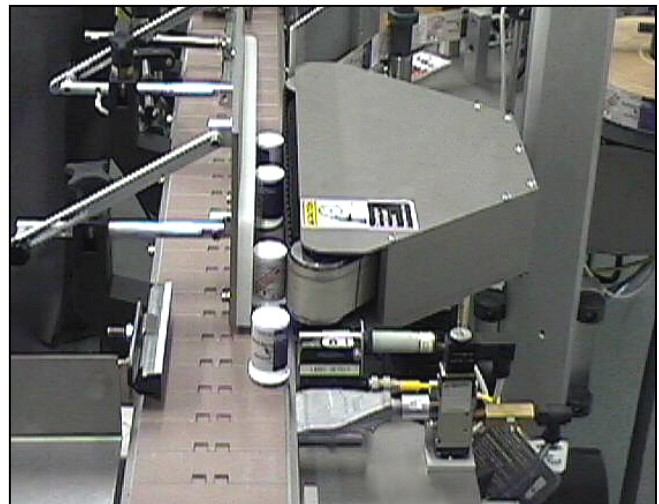
1000 FS application orienting to a thumb tab on the lid.

Versatile, easy to operate, and economical, the model 1000 provides an excellent entry level labeling solution for food and beverage, nutritional, household, and chemical packagers!