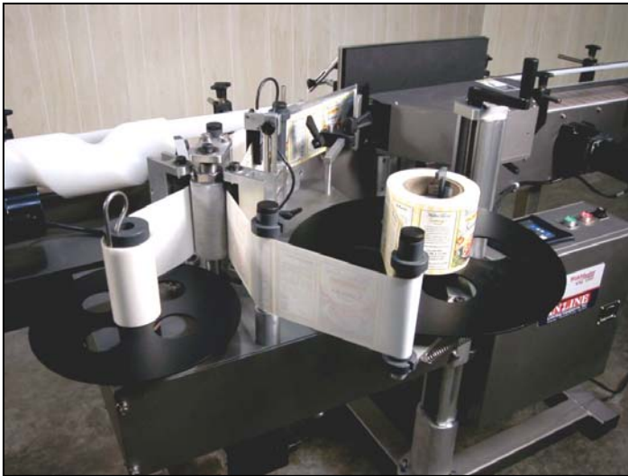
1000 Feed Screw Label