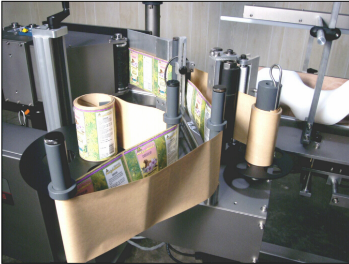
1000 Feed Screw Label Station