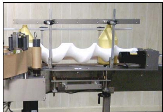
1000 FS orienting gallon containers.

Versatile, easy to operate, and economical, the model 1000FS provides an excellent entry level labeling solution for food and beverage, nutritional, household, and chemical packagers!