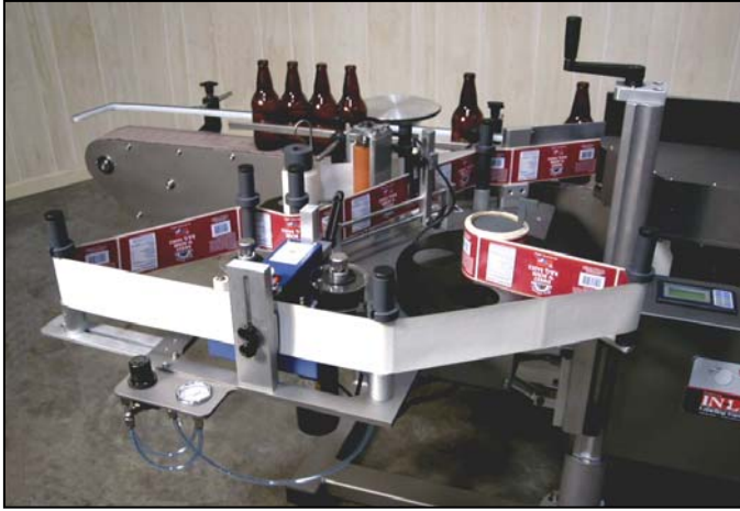
1000 Meheen shown with Hot Stamp Coder.